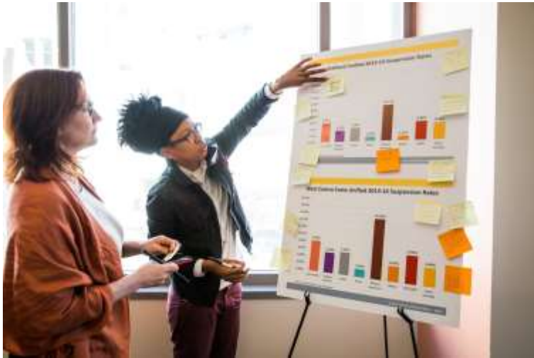
Example of a data walk

A data walk is an interactive way to engage with educational data that allows participants to react to, reflect on, question and pose solutions for issues raised.