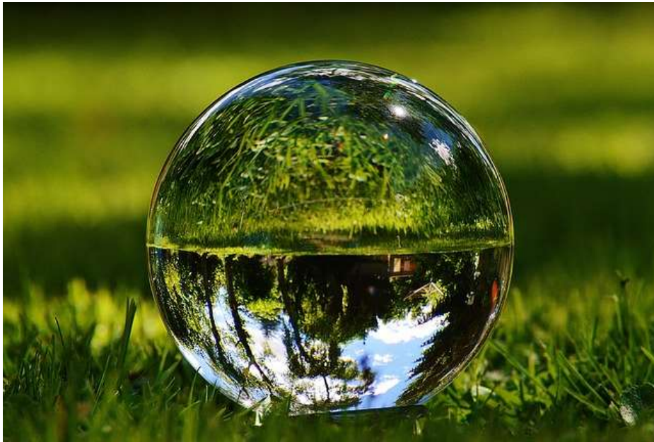
Image reflected on a sphere